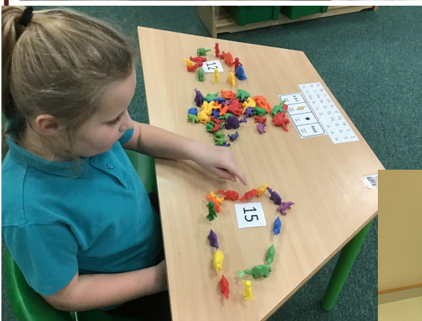
Counting and matching the correct number of objects